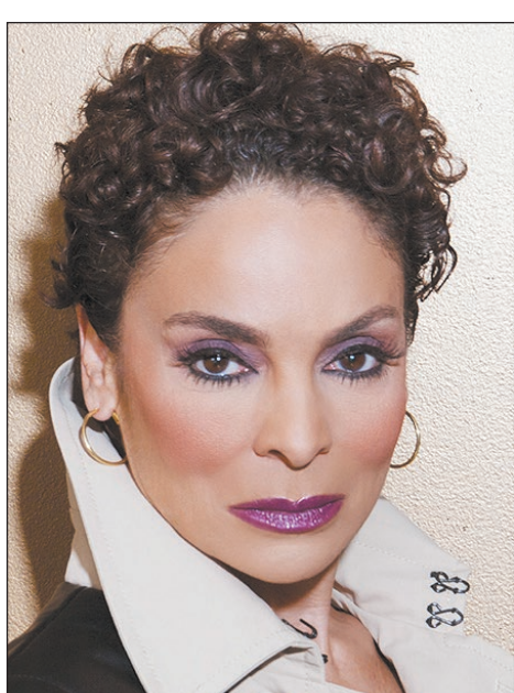
Actress/Producer Jasmine Guy

reer at the Alvin Ailey American Dance Theater in New York City. She went on to star in the original Broadway productions of "Beehive" and "Leader of the Pack." She has also starred in reprised hit productions of "Grease," "The Wiz," and "Chicago." Ms. Guy's won six consecutive NAACP Image Awards for her portrayal of the pretentious and comical southern belle "Whitley Gilbert" on "The Cosby Show" spinoff "A Different World." She played "Roxy," the grim reaper meter maid on Showtime's "Dead Like Me," and as "Grams" on the CW Network's "Vampire Diaries."